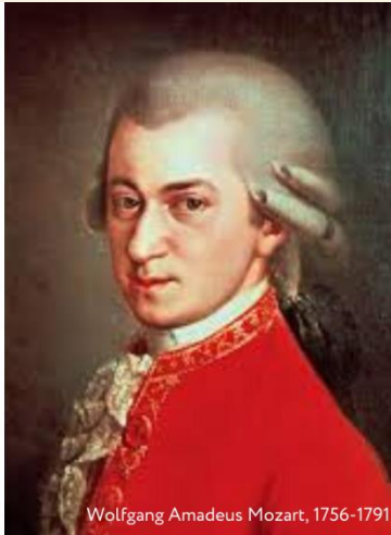
Wolfgang Amadeus Mozart, 1756-1791